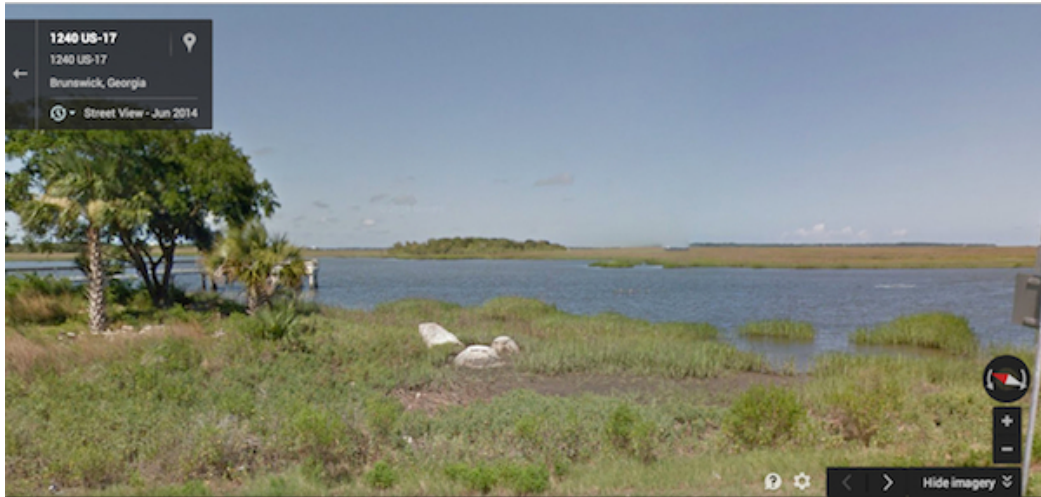
Figure 14: Beverly Buchanan, Marsh Ruins, concrete and tabby, 1981 . (Marshes of Glynn, Brunswick, GA). © Beverly Buchanan.