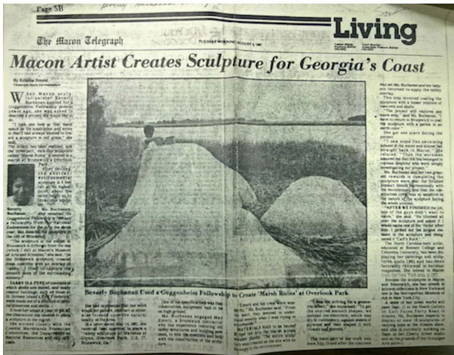
Figure 17: Beverly Buchanan, installing and staining Marsh Ruins, concrete and tabby, 1981. (Marshes of Glynn, Brunswick, GA). (Original photograph published in The Macon Telegraph) © Beverly Buchanan and The Macon Telegraph.

[44] And if by missing it, miss the point.