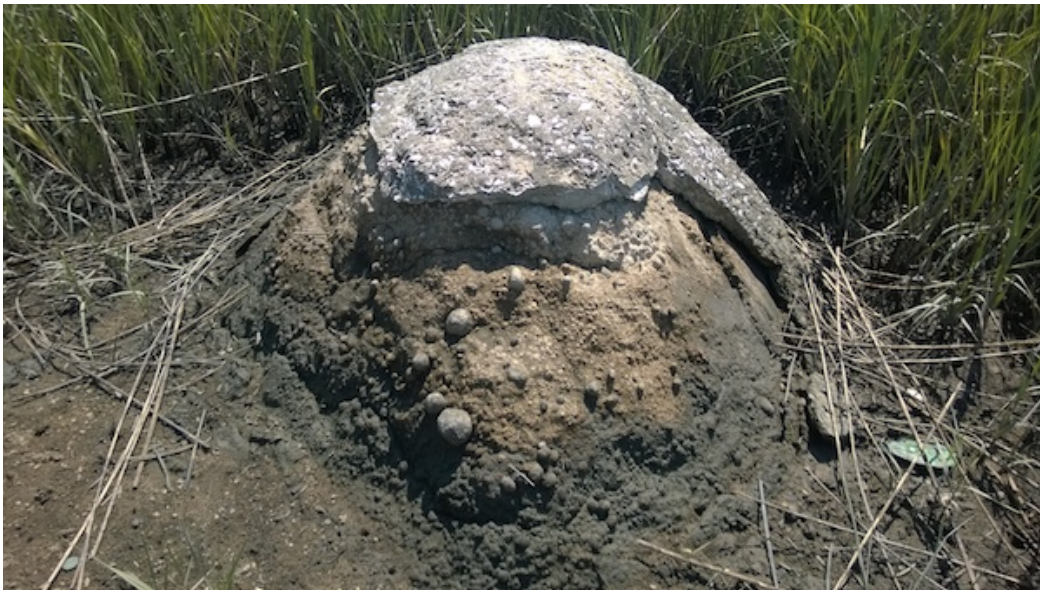
Figure 15: Beverly Buchanan, Marsh Ruins today, concrete and tabby, 1981 . (Marshes of Glynn, Brunswick, GA). Photo courtesy the author. © Beverly Buchanan.