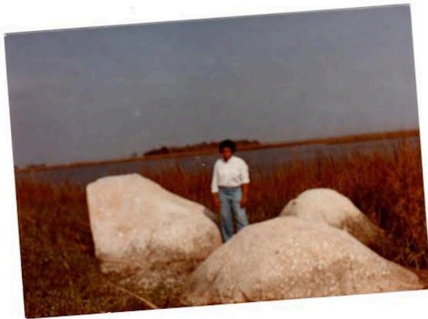
Figure 18: Beverly Buchanan, standing in Marsh Ruins, concrete and tabby, 1981. (Marshes of Glynn, Brunswick, GA).

Photograph courtesy the artist and Jane Bridges. © Beverly Buchanan.