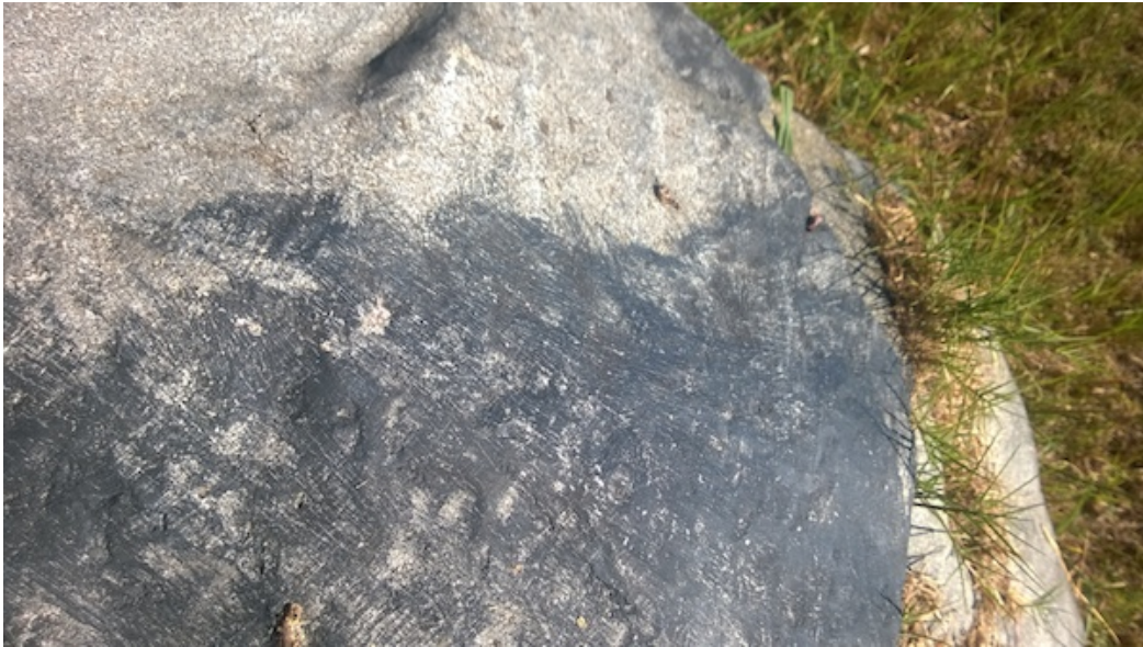
Figure 20: Beverly Buchanan, Unity Stones [detail showing grinder marks], concrete and black granite, 1983. (Booker T. Washington Community Center, Macon, GA). Photo courtesy the author. © Beverly Buchanan.