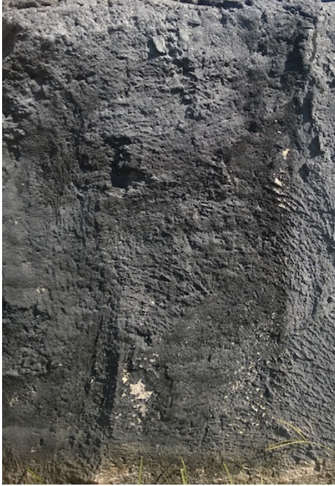
Figure 25: Beverly Buchanan, Unity Stones [detail], concrete and black granite, 1983. (Booker T. Washington Community Center, Macon, GA). © Beverly Buchanan.

[54] The power of thinking through Beverly Buchanan's Georgia installations at this moment in time is that they may also act as complicating, and thus enriching, milestones to the current attention paid to Afrofuturist modalities. Buchanan's works, if they are about futurity at all, are about the past's lack of a dependable one for black people. They suggest a tie between blackness and ruination, a presentness both with and without a future. It would not be too much to argue that the temporal politics Buchanan channeled in the early 1980s have extended well into the present, despite the sometimes loud and dangerously elisive mynah birdcalls of post-racialism today. Because of their insistence on ruination, the continuing presence of the lacunae and fissures that, paradoxically, are the absent/visible tailings of chattel slavery in the United States, Buchanan's work is positioned in situ, geographically, to best explore these anxious historical antimonies and legacies. Afrofuturism has been the name for the generic place (space?) where non-fictive (and often non-recuperable) histories of blacks in the diaspora intersect speculative fiction: and the question is whether Afro-pessimism is the word for a work that reveals, for all its present invisibility, a politics of negativity?