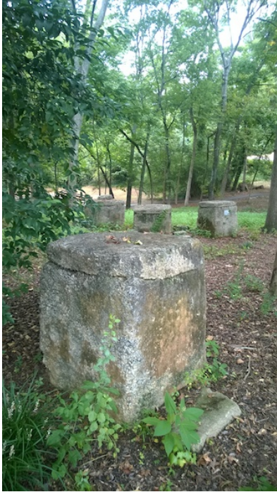
Figure 8: Beverly Buchanan, Ruins and Rituals , concrete and found elements, 1979. (Museum of Arts and Sciences, Macon, GA) Photo courtesy the author. © Beverly Buchanan & MAS.

[34] Many prefer to see Buchanan's choice of site as benign, her choice of material as novel. When Ruins and Rituals is mentioned by critics, it is either surmised to share a tie with prehistoric lithic sites (Lippard, 1983) or African spiritual systems. Lowery Stokes Sims describes Buchanan as "like the shaman/artist in New World and African cultures" making "runes/ruins" and "conjur[ing] the magical quality of the art-making process which first captivated humans thousands of years ago" (Sims, 1981). As critics like Lippard rightly note, the concrete footers and small cast pieces are only one third of the installation. Two other parts exist, but are undocumented. One part was placed further out in the woods, and the third part sunk without witness by the artist in the nearby Ocmulgee River. Like Sol Lewitt's Buried Cube Containing an Object of Importance But of Little Value (1968), Buchanan's secret components engender curiosity for any who know about them—but unlike LeWitt's conceptual gesture, Buchanan's may have more to do with the legacies and politics of blackness in the South. Buchanan points to, via her practice, the long history of racial supremacy and its attendant practice of disappearing black and brown bodies in the South. Buchanan embeds the unrecoverable, the unknowable, and the simply forgotten into her sculptural practice.