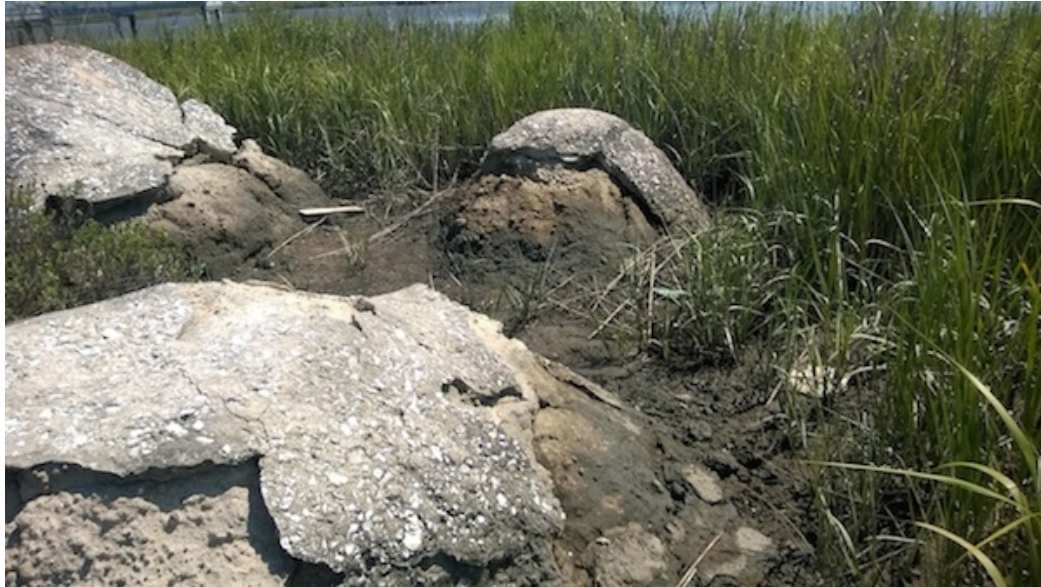
Figure 10: Beverly Buchanan, Marsh Ruins today, concrete and tabby , 1981. ( Marshes of Glynn, Brunswick, GA ). Photo courtesy the author. © Beverly Buchanan.

[36] Unlike Ruins and Rituals , the politics of Marsh Ruins' black negativity is located in its materiality. The three mounds are made of tabby, a concrete of Spanish Colonial origins made with oyster shells and