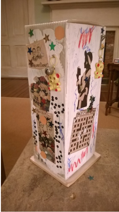
Figure 4: Beverly Buchanan, Untitled , board, collage, sequins, stickers, and plastic and metal elements, n.d. (collection of Jaime Webb and Jim Barfield) Photo courtesy the author. © Beverly Buchanan.

[19] Buchanan's own queerness is a stickier thing: she had long-term relationships with women but never identified as a lesbian. Thus it would be a mistake to attribute that particular identity to her. As Leila J. Rupp remarks in "Loving Women in the Modern World," "there are many and various ways in which women love other women," and not all of them align neatly with an identity category we name "lesbian" (2009). To Buchanan's friends, her relationships with women were another fact about her, maybe just as paradoxically apparent and curious as her blackness—both of which her Macon friends mentioned but never spent a great deal of time elaborating on for me. [10] I am also mindful of the fact that Buchanan's sexuality is never discussed in the literature about her, and that this is inversely proportionate to the times that her blackness is referenced/invoked by writers (myself included). [11] For me, I mention Buchanan's queerness not because it appears explicitly within the work, but because it is so conspicuously absent, operating as another lacuna within Buchanan's complicated oeuvre.