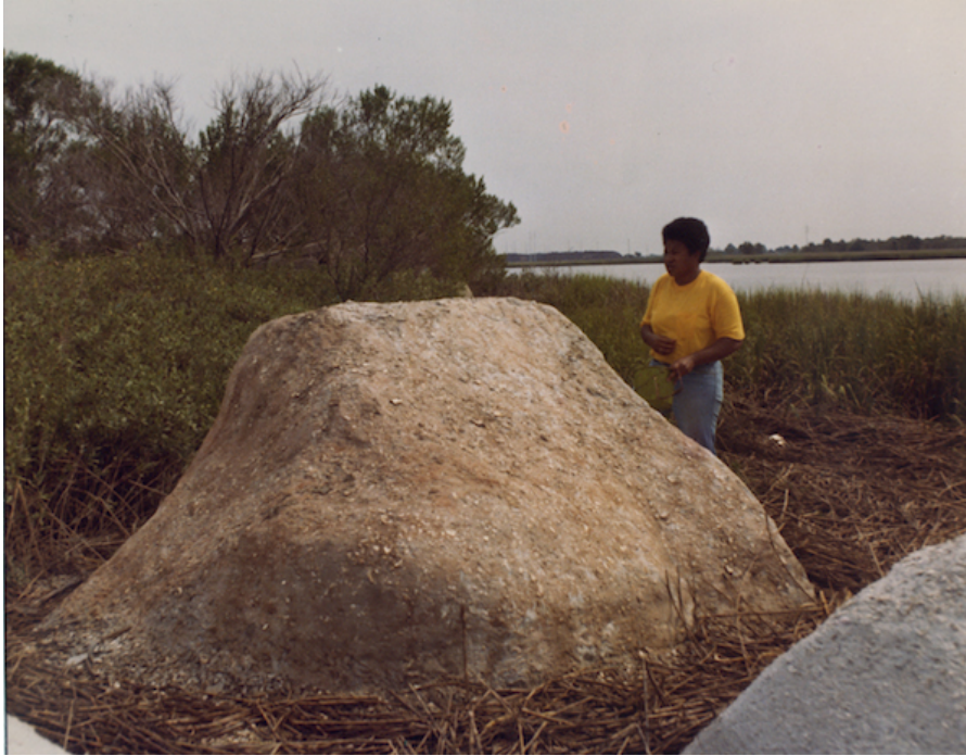
Figure 13: Beverly Buchanan, installing and staining Marsh Ruins, concrete and tabby, 1981 . ( Marshes of Glynn, Brunswick, GA ).

[42] When I set off to find Marsh Ruins , I was told that it was gone, now totally submerged; Google Streetview told me otherwise (figure 14). True: much has changed about Marsh Ruins , making it perhaps the most dramatic example of Buchanan's interest in ruination. The subtlety and beauty of Marsh Ruins' color is long gone, having faded with the sun many years ago. What remains reveals a different subtlety in the sculpture's structure; namely, Marsh Ruins was built in layers, tabby only being an inch or two surface poured atop a more traditional concrete substructure. A body missing parts of its skin, an onion partway peeled. A ruin in ruins (figures 15 and 16).