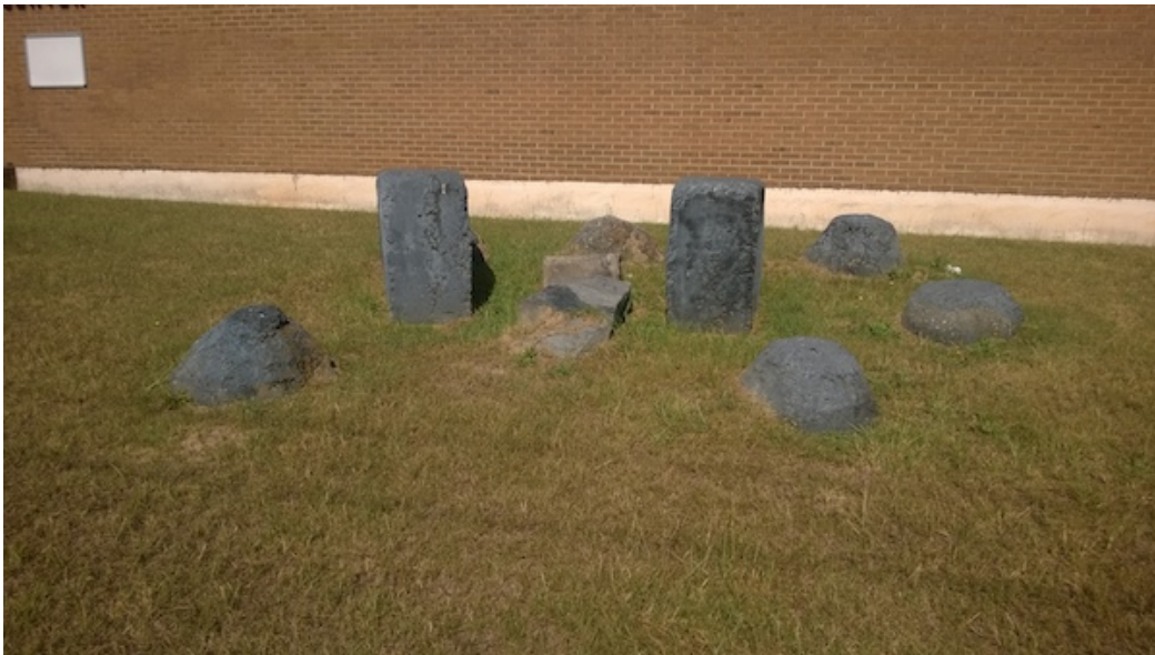
Figure 19: Beverly Buchanan, Unity Stones , concrete and black granite, 1983. (Booker T. Washington Community Center, Macon, GA). Photo courtesy the author. © Beverly Buchanan.

brokers. Formally the sculpture iterates this idea: it is essentially a heraldic arrangement of elements, bisected by the "black Georgia granite" (figure 3). With the six small mounds that surround the two larger rectangular cast concrete forms, a meeting or gathering place is suggested (figure 19). Yet, if this is so, the two rectilinear forms would practically block any kind of group communication or communion. Buchanan's arrangement of Unity Stones is more face-off than sharing circle. The line in the sand (well, grass) is bisected quite literally, in hard granite. Sanded and stripped, the granite still indexes the stress and fatigue of Buchanan's process (figure 20), documented in a series of photographs taken while the artist worked on the installation from her temporary studio outside of the Museum of Arts and Sciences (figures 21-23).