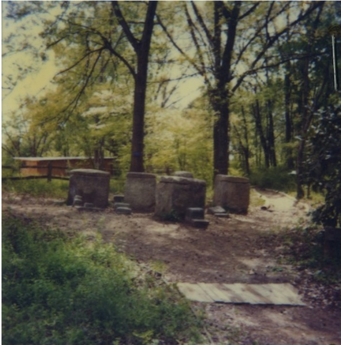
Figure 1: Beverly Buchanan, Ruins and Rituals , concrete and found elements, 1979. (Museum of Arts and Sciences, Macon, GA) © Beverly Buchanan & MAS.

stay completed a host of large-scale public projects across the state. I focus my attention on three of these: Ruins and Rituals at the Museum of Arts and Sciences (Macon, GA, 1979) (figure 1); Marsh Ruins located in the Marshes of Glynn State Park (Brunswick, GA, 1981) (figure 2); and Unity Stones (Macon, GA, 1983) (figure 3). Each project is informed by an engagement with the historical and continuing racialized politics of the Southeast, and articulates a formal and material concern with the kind of black negativity proposed by Afro-pessimist thought.