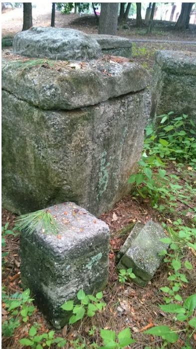
Figure 7: Beverly Buchanan, Ruins and Rituals , concrete and found elements, 1979. (Museum of Arts and Sciences, Macon, GA) Photo courtesy the author. © Beverly Buchanan & MAS.

[30] Pitched by Noble as "a landscape piece," Ruins and Rituals is comprised of four large square footers, and seven smaller cast concrete pieces. The footers were initially stained a variety of subtle colors, mottled lavender and ochre (no longer visible), to play off of the light of the site. Buchanan, writing about Ruins and Rituals , described many "stand-spots" from which to view the "different shadows and colors" of the work (Buchanan, 1979). The footers were taken from an abandoned restaurant or a used car lot (accounts vary), and Buchanan shaped them to appear like cubic sarcophagi. Each of the large footers exhibits a deep, but not complete, cut into its interior about six inches from their top (figure 7). The small cast cement pieces, many looking like bricks or dangerous stepping stools, are opportunities to step up and survey the installation's scene from an ever-so-slightly elevated place.