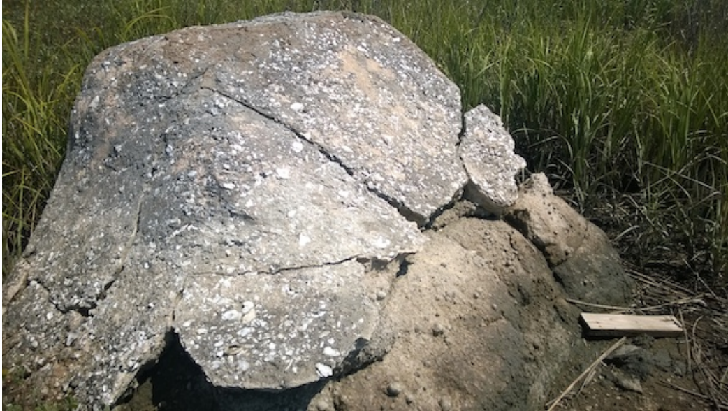
Figure 16: Beverly Buchanan, Marsh Ruins today, concrete and tabby , 1981. (Marshes of Glynn, Brunswick, GA). Photo courtesy the author. © Beverly Buchanan.

[43] In an awful way (or perhaps happily), Buchanan's Marsh Ruins re-performs precisely the trauma of consignment it sought to point to. Its negativity lies in the unavoidable presentness of its condition, and the force of its structural statement is inimically tied to its peculiar ability to get (and stay) lost in plain sight. Buchanan's work absorbs the continual and numbing trauma of daily forgetting. Its condition, now radically different from when it was first installed (figure 17), would not be so shocking today if we had been paying attention all along. Its political force comes from how freely our dismissal was granted, and the tenacity with which it remains in place. When it disappears—and it will—I wonder if anyone will miss it?