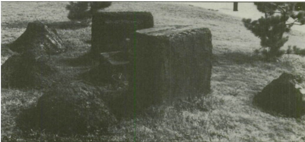
Figure 3: Beverly Buchanan, Unity Stones, concrete and black granite, 1983. (Booker T. Washington Community Center, Macon, GA). Photo courtesy the artist. © Beverly Buchanan.

[6] Described as "stark, raw, [and] a bit terrifying," Buchanan's environmental sculptures of the early 1980s are an encomium on permanence, materiality and racialized ambivalences (Waddell, 1985). Often taking the form of ruins, Buchanan's public sculptures in the Southeast are predicated upon a conception