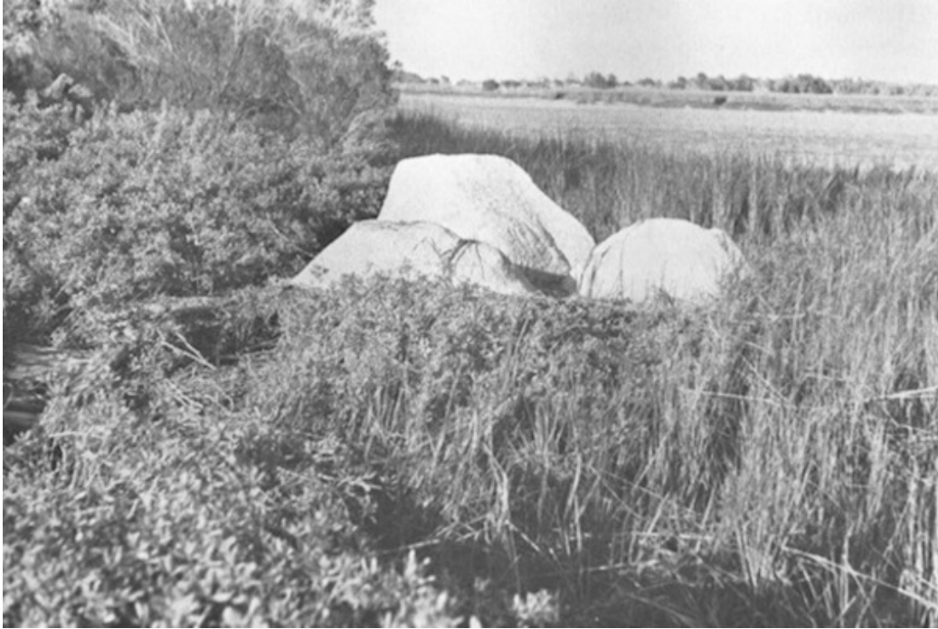
Figure 2: Beverly Buchanan, Marsh Ruins, concrete and tabby, 1981. (Marshes of Glynn, Brunswick, GA). © Beverly Buchanan.