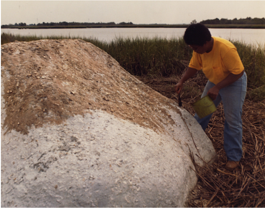
Figure 12: Beverly Buchanan, installing and staining Marsh Ruins, concrete and tabby, 1981. (Marshes of Glynn, Brunswick, GA). (Original photograph in the collection of Museum of Arts and Sciences, Macon, GA) © Beverly Buchanan and MAS.

Buchanan claimed this patina ensures the sculptures would blend with their surrounds (Simms, 1981). But in staining the tabby Buchanan knew that the stain would only "take" to the non-shell components of the slurry. The resultant flecked surface would have imbricated both brown and white in a lumpen political body.