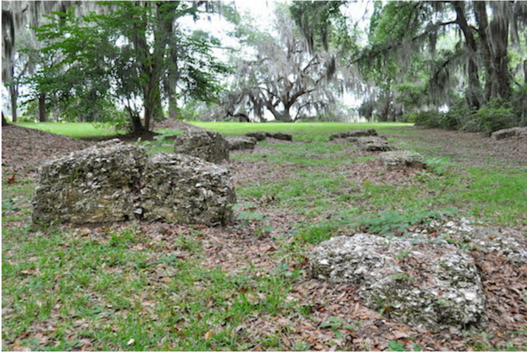
Figure 11: Tabby foundation ruins, Fort King George, Darien, GA.

lime. Tabby is a charged material, especially for a sculpture sited along the Georgia coastline, as many sugar and cotton plantation buildings were made with the stuff, particularly slave quarters and sugar houses (Coulter, 1937). Ruins of these tabby structures can still be found on the Georgia and Florida coast: St. Simeon Island, Sapelo Island, and Ossabaw Island, among others (figure 11). The oyster shells create a surface that goes beyond rustic—it is sharp, unfriendly.