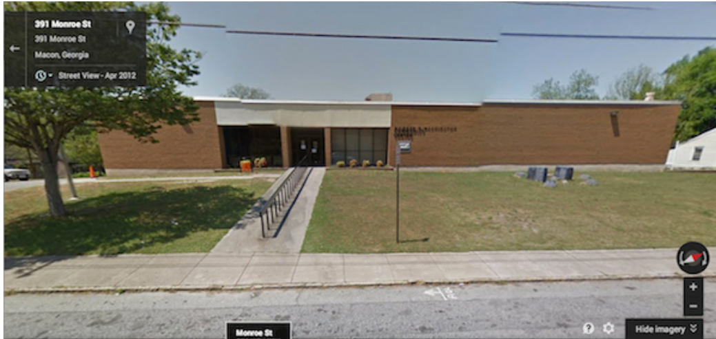
Figure 24: Beverly Buchanan, Unity Stones , concrete and black granite, 1983. (Booker T. Washington Community Center, Macon, GA). Screenshot via Google Street View, captured September 30, 2014. © Beverly Buchanan.

[51] Unity Stones still sits there, not three blocks from Buchanan's former residence on nearby College Street. While College Street is full-up with generous stately homes, in the late 1970s and early 1980s the area was less developed, less polished. It was, and still is, a boundary between a middle/upper class white population and a working class black population. This was one of many lines that Buchanan treaded in both her work and her life.