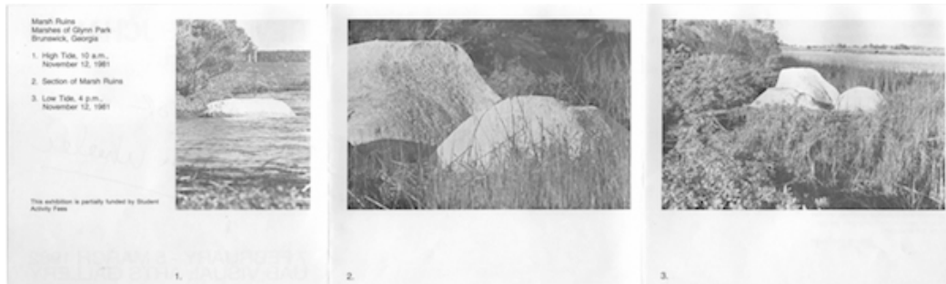
Figure 9: Beverly Buchanan, Marsh Ruins at high and low tide, concrete and tabby , 1981. ( Marshes of Glynn, Brunswick, GA ). (Reproduced from UAB Arts Gallery Exhibition Pamphlet, " Beverly Buchanan: Sculpture , 1982) © Beverly Buchanan.

Ruins nearly disappears in its surrounds, despite the sculpture being nearly five feet in height. Although not fragments/frustule precisely, this is the closest Buchanan came to realizing her dream of "fragments in tall grass." Daily the sculpture is flooded by the tide (figure 9) which, years after its installation, has left the sculpture in a truly pitiable state: cracked, broken, and partially buried in smelly marsh mud (figure 10). Tiny crabs and spiders scurry out of the ground, creeping into the cracks and finding shelter in the wrecked forms—it is to them no doubt a tired and familiar part of their landscape, no different than an overgrown tree stump. Just another place to hide.