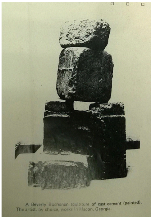
Figure 6: Beverly Buchanan, Untitled , concrete, n.d. (reproduced in Contemporary Art/Southeast Vol 2. No. 3 ,